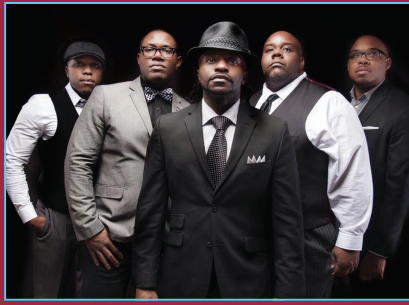
Just a Few Cats